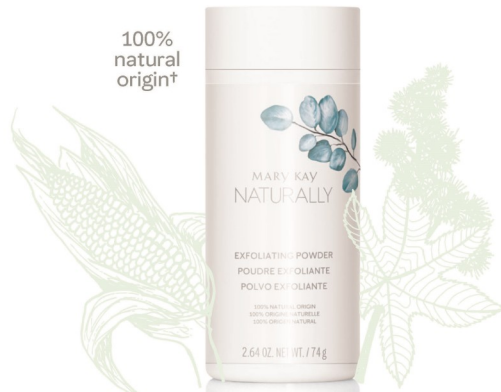
Mary Kay Naturally™ Exfoliating Powder, $34

Gently exfoliates thanks to hydrogenated castor oil and citric acid .