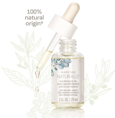
Mary Kay Naturally™ Nourishing Oil, $48

Leaves skin feeling hydrated and contains a blend of sweet almond, olive and sesame oils .