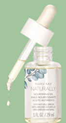
Mary Kay Naturally™ Nourishing Oil