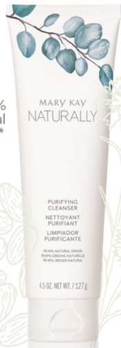
Mary Kay Naturally™ Purifying Cleanser, $26

Infused with skin-soothing cornflower floral water and sweet almond oil , helps remove dirt and leaves skin feeling nourished and soothed.