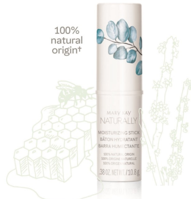
Mary Kay Naturally™ Moisturizing Stick, $28

Made with candelilla wax and beeswax , it relieves dry skin, anywhere, anytime.