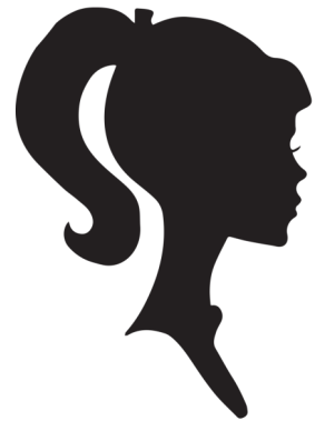
Queen of Sharing: It's a tie! See page 2!